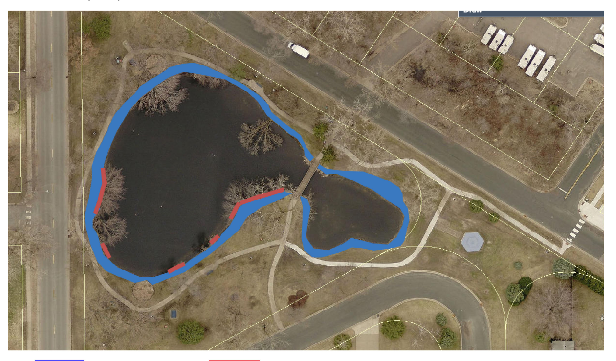
City of Spring Lake Park - Proposed Triangle Park Pond buffer strip map June 2022